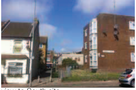
view to South site