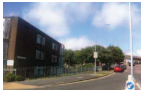
view from Whitehawk Road along Manor Way